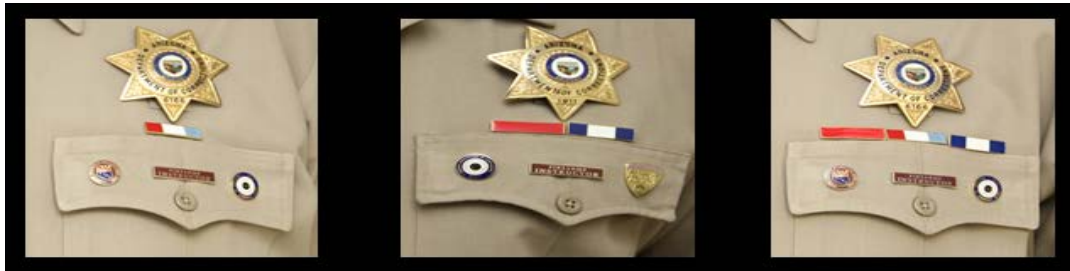
Figure 16 – Award Ribbons and Proficiency Pin Placement