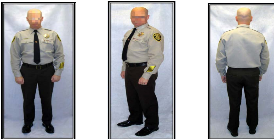
Figure 8 - Class A Uniform