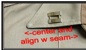
Figure 12 – Captain Rank Insignia Placement