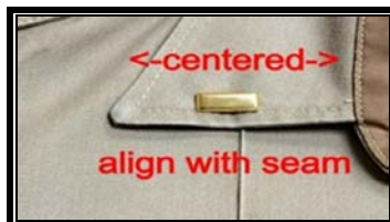
Figure 13 - Lieutenant Rank Insignia Placement