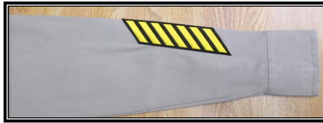
Figure 5 - Service Stripe Placement

1.7.1.8.2 Staff who have separated and rejoined the Department may count all years of Department service towards the total number of hash marks worn on the uniform. Experience with any other agency does not count towards the total number of service stripes, nor do the years in between tours of duty with the Department.