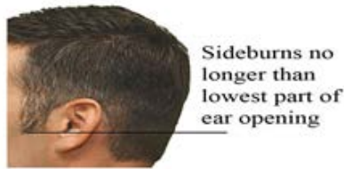
Figure 2 - Men’s Sideburns