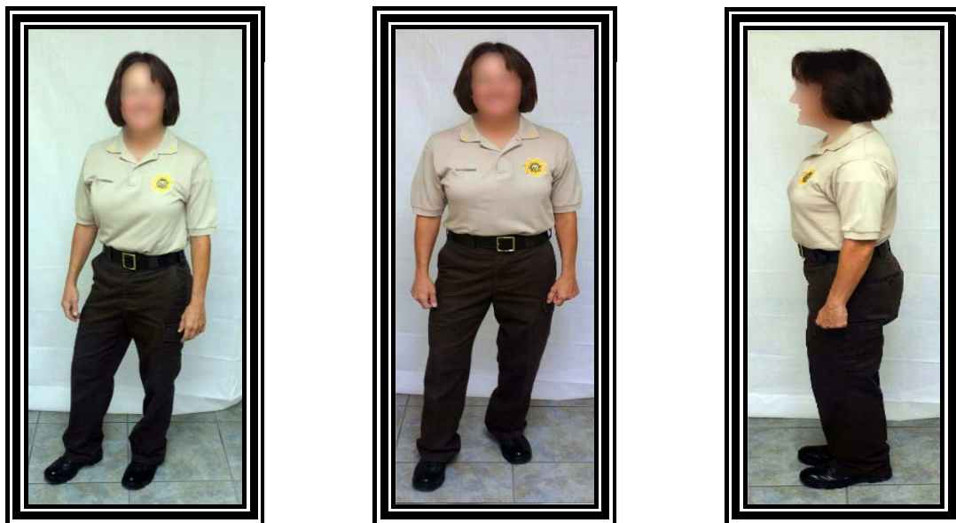
Figure 10 - Class C Uniform