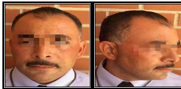
Figure 3 - Men’s Mustaches