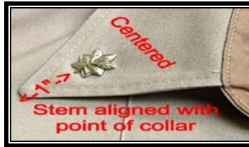
Figure 11 – Major Rank Insignia Placement