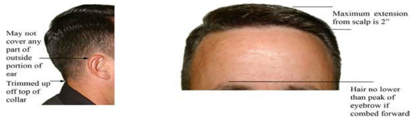
Figure 1 - Men’s Hair Standard