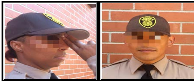
Figure 7 - Proper Wear of Baseball Cap

1.7.1.10 Belt - A black leather dress belt with gold buckle shall be worn. If a duty belt is worn, the belt with the gold buckle can be replaced with a suitable “under belt.”