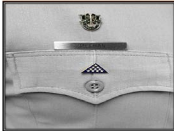
Figure 17 – Optional Accoutrements Placement