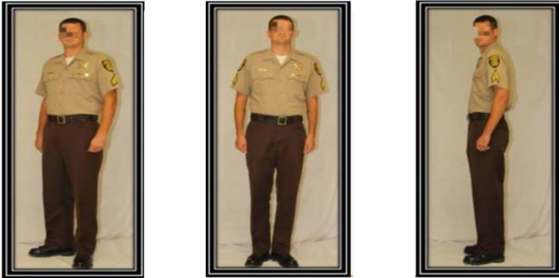
Figure 9 - Class B Uniform