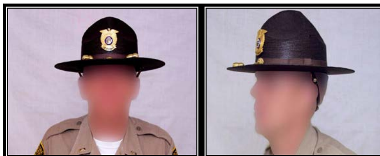
Figure 6 - Proper Wear of Campaign Hat

1.7.1.9.1.4 No other accessory or decoration may be affixed to or worn on the campaign hat.